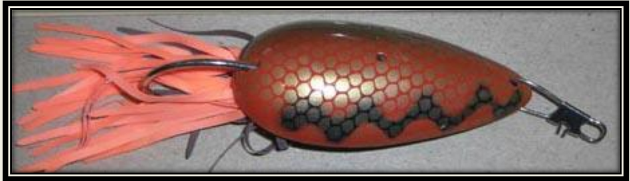
Heddon Moss Boss in Crawdad, series #515CDA

The company had their Moss Boss made by a school for the handicapped in Missouri. Rods were wrapped by hand by Native American Indian women shortly before most rod-making was sent overseas to be done.