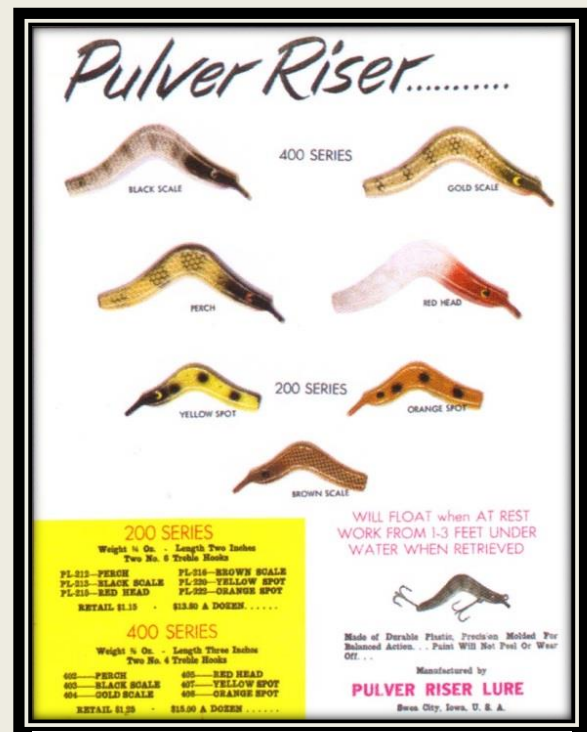
This was a jobber and dealer advertising and ordering sheet