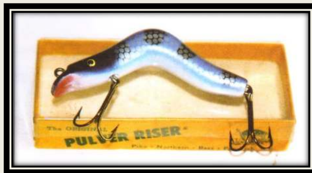
2400 Series blue scale finish Pulver Riser, special color. Purchased by special request only. Lynn thinks he made only about 200 in this color.

At first, the entire assembly process and finishing was done by Lynn and Alice in their home and garage. In time, they rented a building across the street where all the lures were painted, and later, they purchased a larger house where all the assembly and painting was done. At times, they hired part-time help as well.