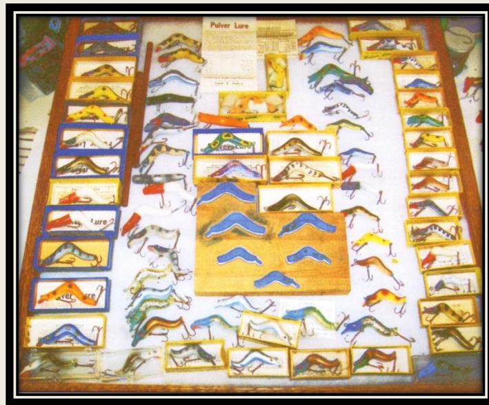
A nice collection of Pulver Riser lures (some trial colors)