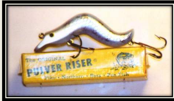
1EI Leecho 700 series. Color: Silver (Std. color)