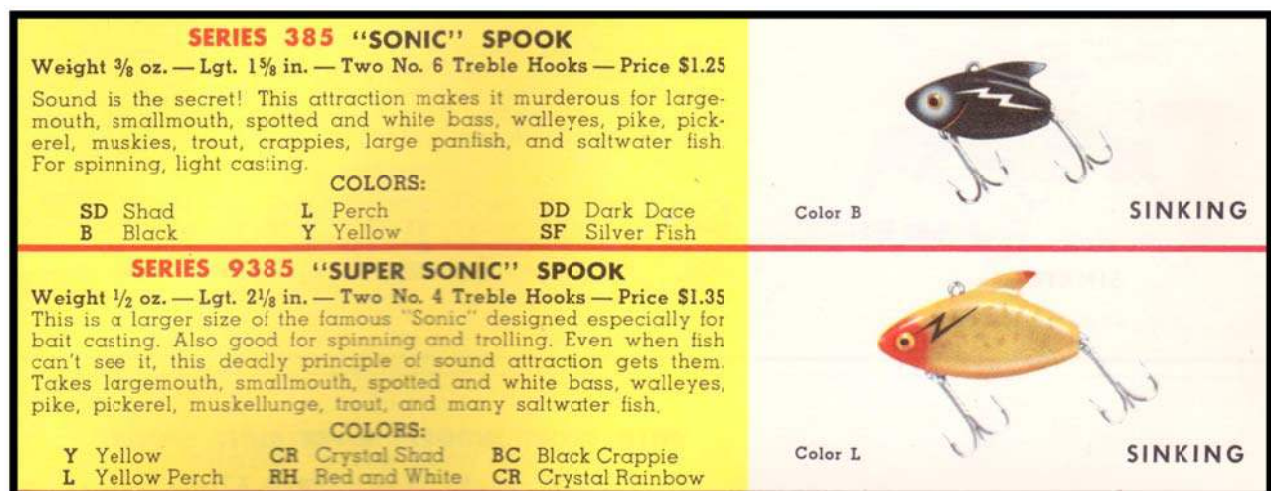
"NEW" FOR 1957 HEDDON CATALOG SONIC LISTING