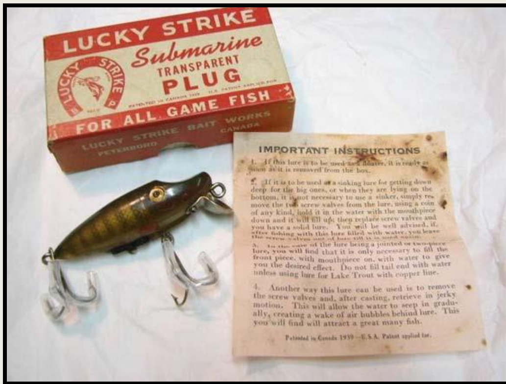
Lucky Strike Submarine Transparent Plug