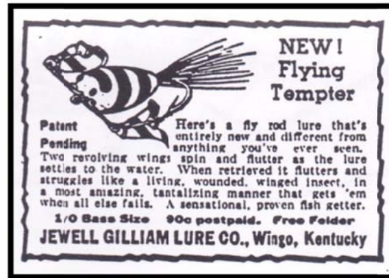
Company Ad - Sports Afield, 1938