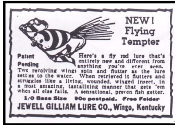
Company Ad - Sports Afield, 1938