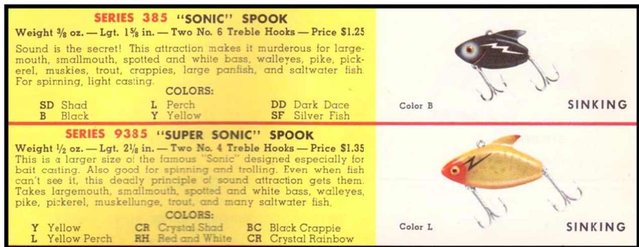
"NEW" FOR 1957 HEDDON CATALOG SONIC LISTING