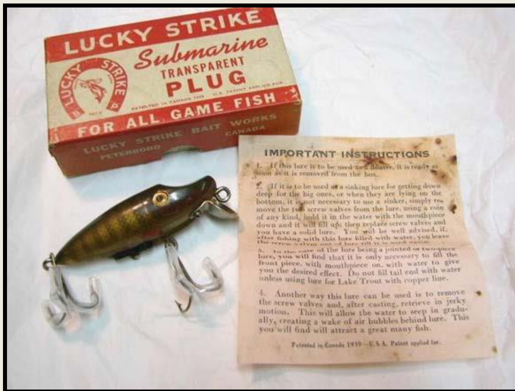
Lucky Strike Submarine Transparent Plug