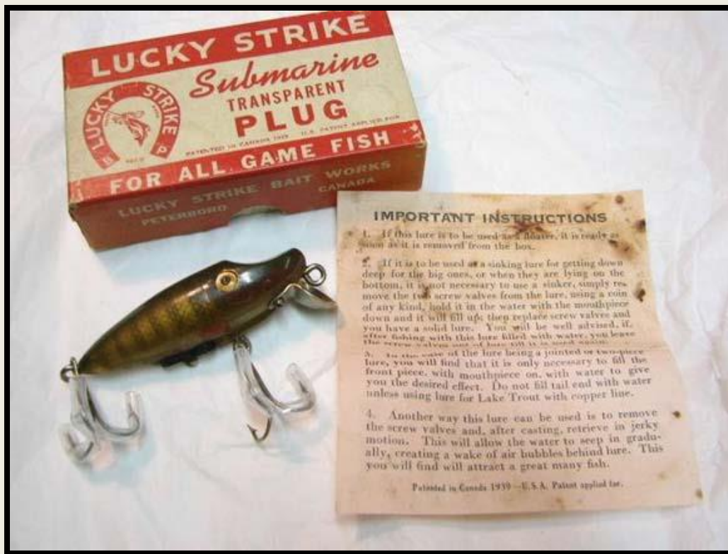
Lucky Strike Submarine Transparent Plug